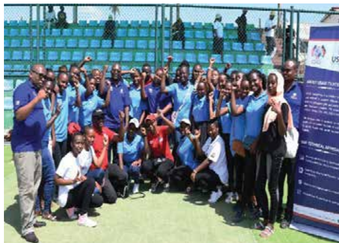
USAID Tujitegemee collaboration with Stawisha Pwani in the commemoration of World AIDS Day 2022

USAID Tujitegemee is a five-year program funded by USAID and PEPFAR to support orphans and vulnerable children (OVC) & Adolescent Girls and Young Women (AGYW) in Kilifi and Mombasa counties. Ananda Marga Universal Relief Team (AMURT) - Prime, and its Consortium partners, implements the program: The Partnership for a HIV Free Generation (HFG), Women Fighting Aids in Kenya (WOFAK), the Council of Imams and Preachers in Kenya (CIPK), and KWETU Training Centre for Sustainable Development (KWETU). In line with USAID Kenya Health Partnership for Quality services (KHPQS) framework, the program aims to increase access to and demand for quality HIV prevention services, as well as increasing access to quality health and social services for OVC and their families.