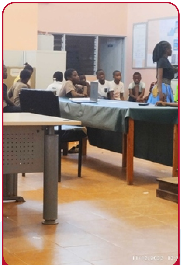
OTZ at KCH