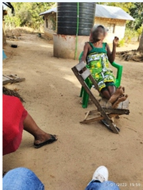
HH visit at Kibarani

Kilifi satellite office is located in Sokoni ward, Kilifi North constituency. It is one of fast developing town in Kilifi County, the site under Tujitegemee project serves 4 wards; Sokoni 925(M-457, F- 468), Mnarani 617(M-283, F- 334), Kibarani 577(M- 289, F- 288) and Tezo 531(M-273, F-258). In COP 22 OVC program the site enrolled a comprehensive caseload of 2651 against the COP target of 2313 and served 2651 OVC. From the total caseload Kilifi site has 59 SINOVUYO and 183 boys in CBIM preventive programs.