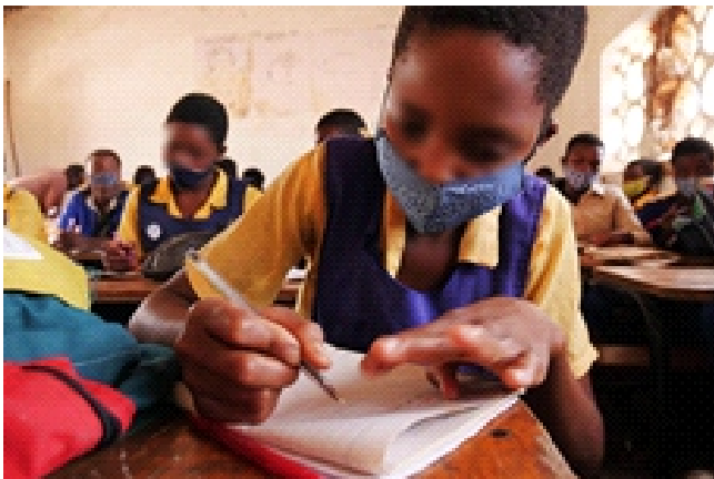
Ongoing classroom session

We work jointly with Zinduka Support Group at Shingle GRC, in Sokoni Ward where our caregivers enrolled are able to get cash transfer, Training on financial literacy, treatment literacy, and psychosocial support to help them better themselves. CHVs were also trained on new ART guidelines and VL cut off